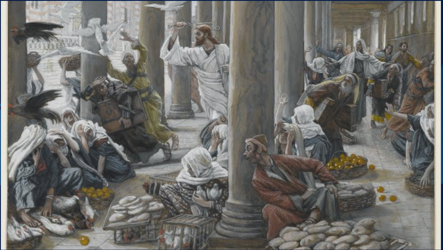
The Merchants Chased from the Temple James Tissot (1836-1902)

In today's gospel, Jesus chases the merchants and the money changers from the temple. He throws their money on the ground, drives out the animals, and turns over their tables. "Stop turning my Father's house into a marketplace!" Why this destructive violence? John gives us the key in a psalm verse: "Zeal for your house consumes me" (Ps 69:10). Jesus' anger expresses this zeal. He cannot bear to see the house where God meets his people diverted from its purpose.